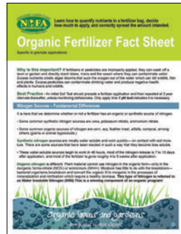
The NOFA Organic Fertilizer Fact Sheet