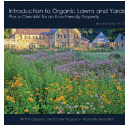
Introduction to Organic Lawns and Yards