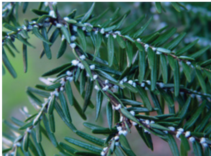
Photo: Woolly Adelgid ( Adelges tsugae ) Copyright © Christopher Evans, River to River CWMA, Bugwood.org

The most common and highly effective organic treatment method is to spray the affected trees with horticultural oils during the insect's growing season (late March through mid-April). A landscaper who has the spray equipment necessary to reach up into the tree usually does this. Vegetable based, rather than petroleum based, horticultural oil is available, generally through organic landscapers. Make sure you don't inhale the mist from the spray during application, as it is a respiratory irritant. If you do it yourself, read the label and follow the precautionary statements.