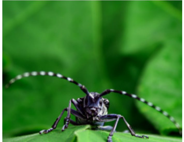
Asian Longhorned Beetle ( Anoplophora glabripennis)

In Connecticut and Massachusetts, important pests to report include the emerald ash borer, a devastating pest of ash trees, and brown marmorated stink bug, which overwinters inside buildings, but also damages many fruiting crops during the growing season. The distribu-