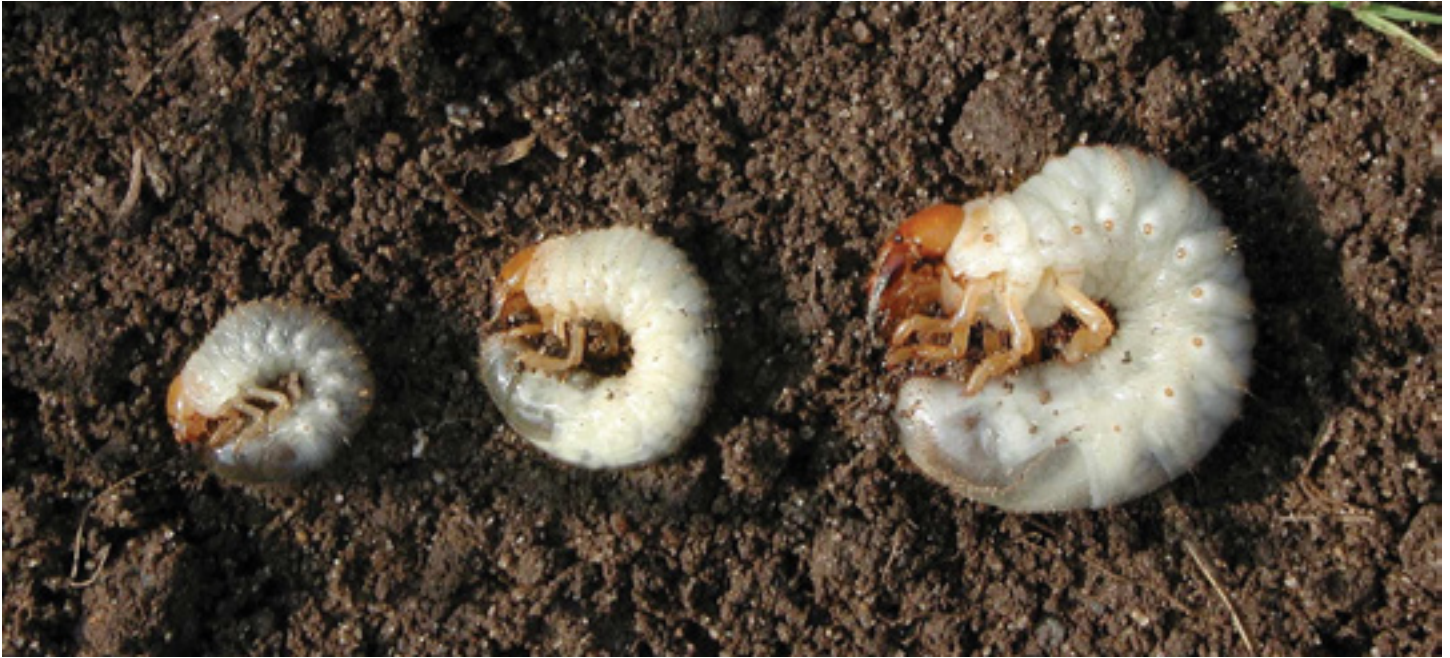
White grub species, left to right: Japanese beetle ( Popillia japonica ), European chafer ( Amphimallon majalis ), and June bug ( Phyllophaga sp.)

grubs. Soil moisture and timing is a major factor in determining grub density in any given year. All white grub species require moist soil for their eggs to hatch and young grubs are very susceptible to desiccation. Watering during adult beetle activity in the early summer attracts egg-laying females. The different species have somewhat different life cycles, but most eggs are laid in June or July. Because organic lawn management minimizes watering, egg-laying females tend to be less attracted to these lawns. However, once the larvae begin to eat and grow in late August, the grass becomes more susceptible to drought and the larvae become more resistant to it. Usually the soil moisture increases in September as the weather cools. If not, some watering may be warranted. Higher moisture at this time is helpful