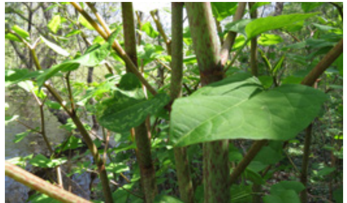
Photo: Japanese Knotweed ( Fallopia japonica ) is highly invasive and difficult to remove. Copyright © Sarah Little

Corn gluten meal is sometimes used as an organic weed preventative (pre-emergent) in the spring, particularly for crabgrass, which is an annual plant, since it pre-