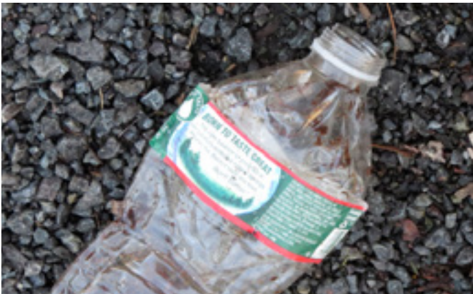
Photo: Mosquito breeding sites can exist wherever there is standing water. Copyright © Sarah Little

Mosquitoes are annoying, and in our area can carry West Nile Virus and Eastern Equine Encephalitis, and are responsible for transmitting heartworm to dogs. We will never eradicate mosquitoes, though people certainly have tried. They are one of the most resilient creatures on this earth and are famous for being able to develop resistance to pesticides. There are more than 50 species of mosquito in the Northeast alone, and each one has specific feeding, breeding and biting behaviors. We can't eliminate them, but there are some very effective techniques for keeping them away from us.