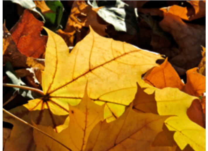
Photo: Organic mulches like fallen leaves mimic natural cover. Copyright © Sarah Little

Mulch is a layer of material—either organic (wood or bark chips, leaves, seaweed, etc) or inorganic (gravel, sand, etc.)—applied to the soil surface. The natural state of soils in the Northeast is to be covered with plant material—whether alive, dead, or both. This layer performs many functions that are vital to plant and soil health. Organic mulches such as decomposed leaves, compost, seaweed or other decomposed plant matter mimic this natural cover by adding organic matter, humus, and nutrients to the soil; providing a substrate for beneficial microorganisms; retaining moisture; controlling erosion; moderating soil temperature fluctuations; and helping to suppress weeds. Inorganic mulches, such as stone, gravel, plastic or weed barrier fabrics are less desirable because they do not contribute to soil or plant health and are usually more ecologically harmful to produce and transport, but they can sometimes be reused and do not need to be replenished as often as organic mulches.