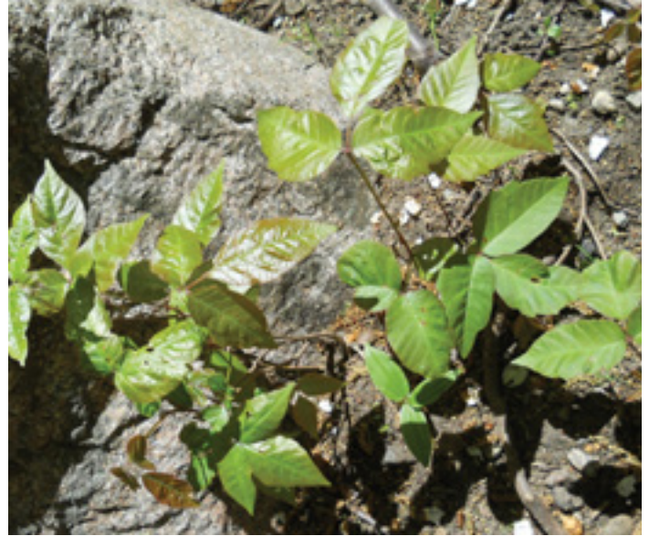
Photo: Poison Ivy ( Toxicodendron radicans )

Poison ivy fruit is an important food for birds and is a native and ubiquitous plant. Poison ivy leaves, stems, roots and berries contain the oil urushiol, which can cause allergic skin rashes, sometimes severe, in many people. For these reasons, poison ivy is best left unmolested whenever feasible. If you want to remove it from an area where humans will have contact with it there are some precautions to consider. Do not burn it as this can make the urushiol airborne and injure your lungs. There are organic herbicides available to kill poison ivy. However, they kill the leaves and require repeated applications to weaken and eventually kill the plant itself. There are lotions available that you can apply to your skin before and after working in your yard that are designed to block and remove urushiol. If you plan to hand-pull it, make sure you protect your skin and clothes from coming in contact with any part of the plant by