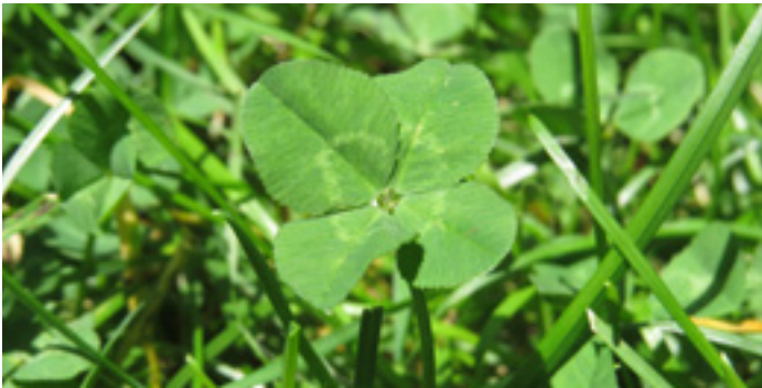
Photo: White clover ( Trifolium repens ) helps deliver essential nitrogen to your lawn.

Organic lawns can provide beauty, function, cost savings, pest resistance, drought tolerance, ecological services and minimal health risks. All these benefits are maximized if you maintain a lawn dominated by dense, deeply rooted, site-adapted turf grasses.