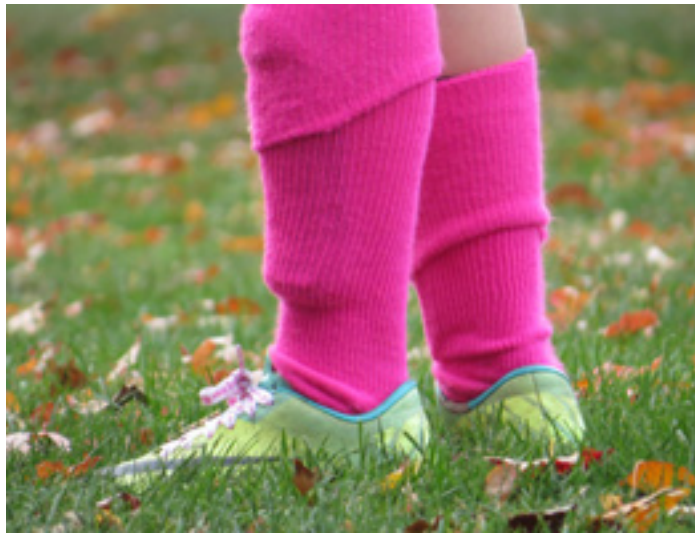
Photo: A soccer player is dressed for cancer awareness. Copyright © Sarah Little

Generally, rather than tear up your yard, you will be more successful if you renovate and keep some of your existing plants that have already adapted to your yard. Of course, there are cases where you need to install a new lawn from scratch. You might have just had construction done, or had some other major damage to your lawn. You will probably need to hire a professional for